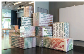
Logos Bergen Assembly