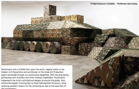
Fridericianum CASSEL - Polemos Germany