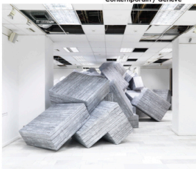
Demos - Documenta 14 / Athens