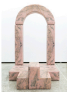
Frieze London Art Fair